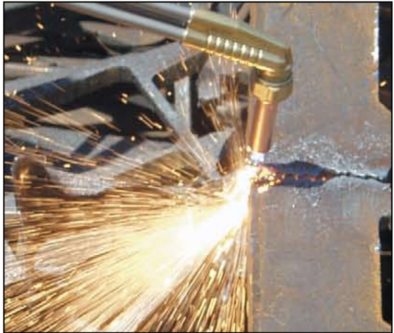
Bulldog tips put more muscle into your cutting job.